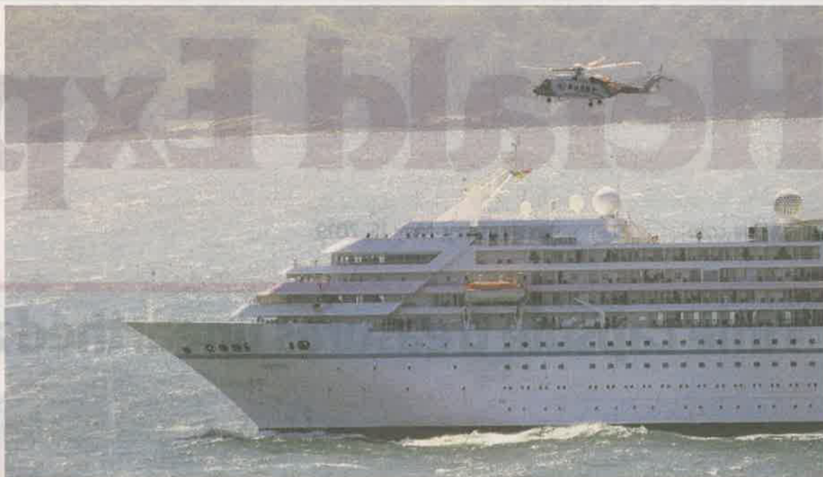
» A COASTGUARD helicopter airlifted a sick passenger off a luxury cruise liner in Tor Bay yesterday. The drama happened as the giant cruise ship Amadea arrived in the bay at the start of her season in Europe. She came into the bay just after midday and was met by the Newquay-based helicopter which hovered overhead. The Amadea then turned back out of the bay again, steaming into the easterly wind as the pilot manoeuvred the helicopter above the deck. After half an hour the helicopter left the scene and flew to Plymouth's Derriford Hospital. The cruise ship turned back into the bay and dropped anchor off Torquay. She had arrived in the bay from Cork, having crossed the Atlantic from Newfoundland. She was built in Japan and entered service as the flagship of the German Phoenix Reisen line in 2006. She has two royal suites, 40 suites and 254 cabins, 106 of which have private balconies. She cost $150m to build. The Amadea is due in Bremerhaven tomorrow to begin a busy summer schedule around Europe. At the weekend Artania, another cruise ship, called in the bay.

"The aim is to improve access to the station to over 3,000 employees that work on the Brunel Industrial Estate and to the Buckland residential area which has over 1,400 houses."