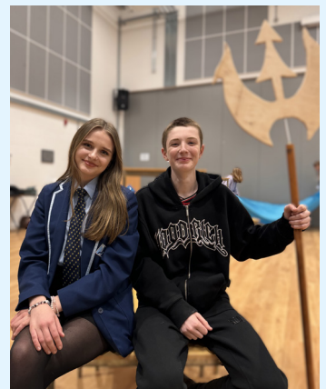
Grimsby & King Triton